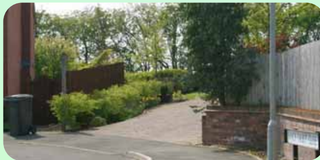
Nancy Talbot Close - leading to the footpath

Turn left and after 15m cross the road into Nancy Talbot Close (3) and walk straight ahead onto a footpath to the right hand side of house number 5. This leads via a stile onto the field at the rear of the houses.