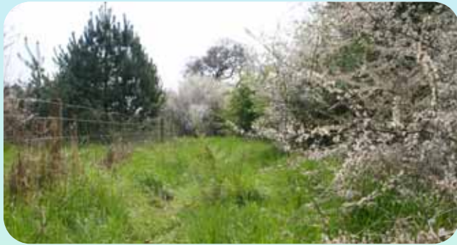
Path continues with hedge on the right and fence on left

Go over the stile and bridge then follow the path round to the left. Here the path continues with a hedge on the right and fencing to the left.