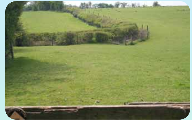
View at stile towards Cow Lane - hedgetops on the horizon

Cross the field diagonally left to the far corner through a wide gap. Follow the left hand side of the field, over stiles at either end of a bridge.