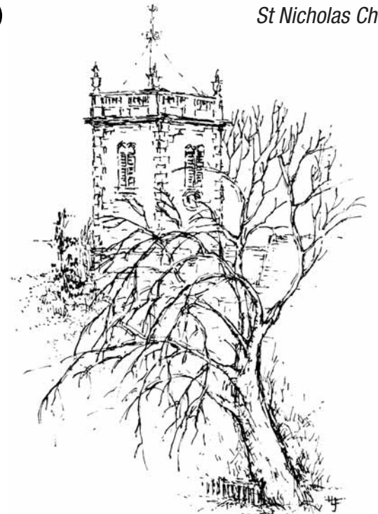
St Nicholas Church