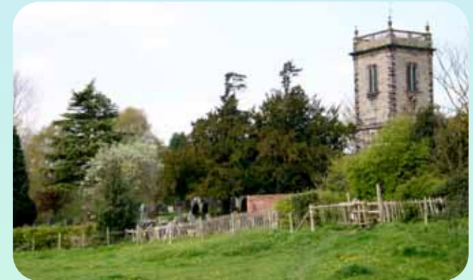
Approaching the churchyard from Hallhill Lane

Walk along the track until it reaches the junction with Hallhill Lane where you will see a stile opposite you (12) . Go over the stile into the field keeping to the left of the farm buildings.