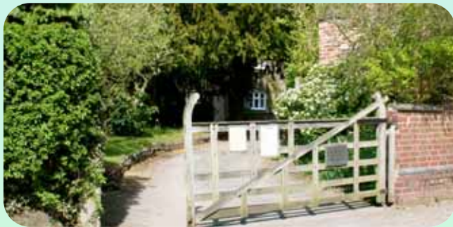
School House - formerly the Free Grammar School