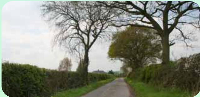
View along Broad Lane towards Lichfield Road

Continue until a sharp right hand turn leads to another stile and bridge which you cross (6) . Go diagonally left across this next field, keeping about 30m to the left of the pole in the opposite hedge, to reach a stile in the far corner onto Broad Lane (7) .