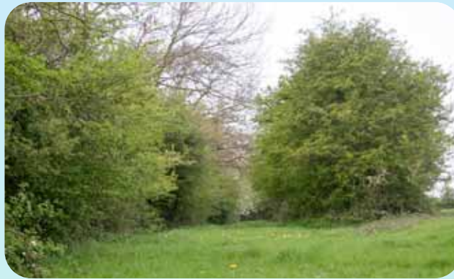
The inner hedge parallel to Seedcroft Lane

Turn right along the lane, cross the Lichfield Road with care and continue along Seedcroft Lane opposite. 75m after passing the end of Mill Lane, which is unnamed and the first lane on the right, go over the stile on the right (8) .