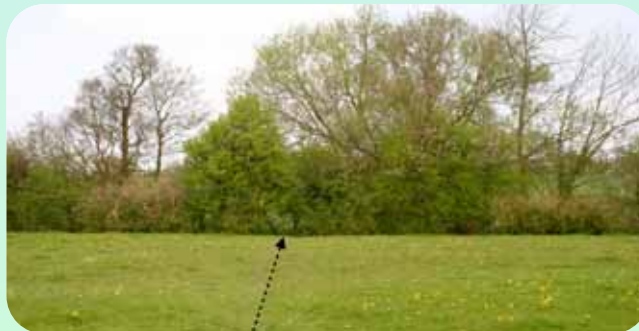
Gap through to stile and the bridge over brook

Walk diagonally across the field, keeping to the right of the pole and nearby pit, towards the large school building on the horizon just visible through the tree line.