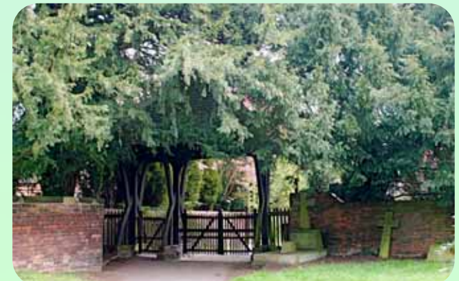
Lych gate leading back to the High Street and Market Place

Aiming for the church tower, cross the stile into the churchyard (13) and onto a tarmac path. Following the path with the vicarage hedge and wall close on your right, you will reach the lych-gate (14) which you pass through. After this take the first left turn to return to the Butter Cross.