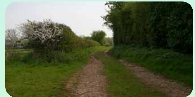
View along Cow Lane towards the stile

From the stile, continue straight ahead, keeping to the left of the next field, to join the usually muddy Cow Lane.