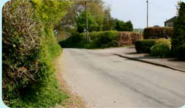
Radmore Lane - looking towards kissing gate

Go diagonally across the playing field to the far corner, keeping to the left of an old sports pavilion. If there is a games lesson or village cricket match in progress, go round the edge of the field to the right to join the path near three coniferous trees. Leaving the playing field, follow the path, which goes between the tennis courts.